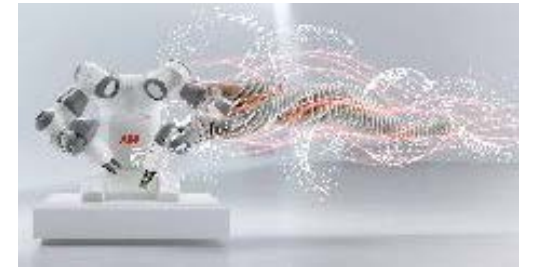
Robotics & Motion