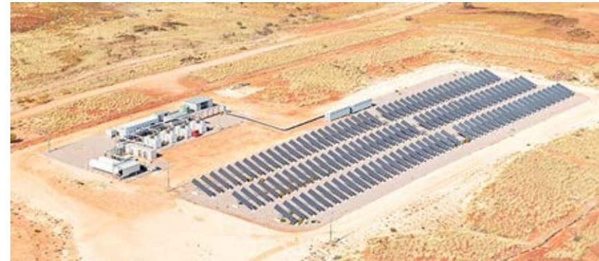
Hybrid microgrid solution