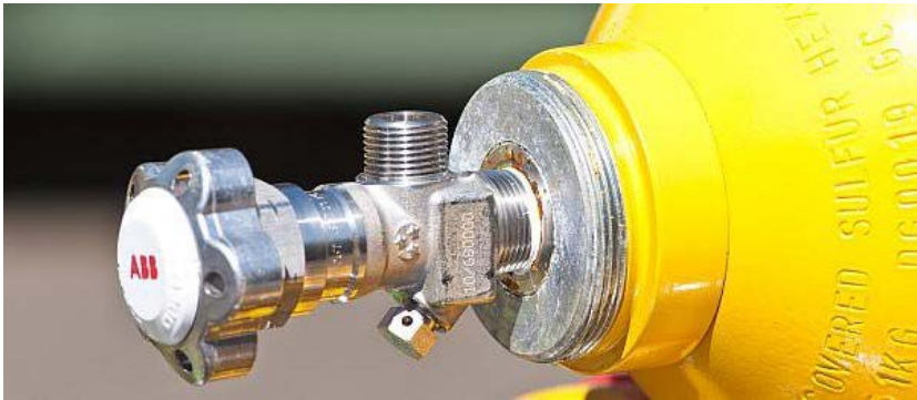
World first SF6 gas management solution